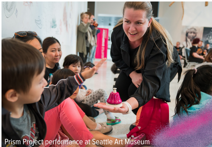
Prism Project performance at Seattle Art Museum