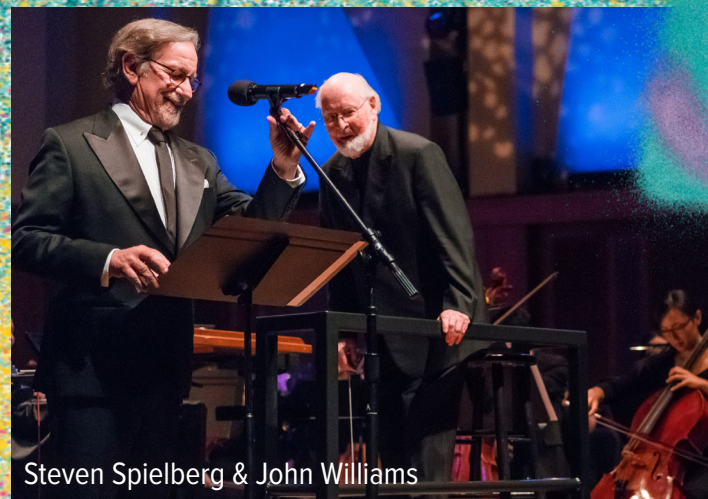
Steven Spielberg & John Williams