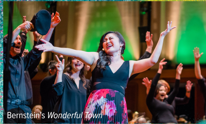
Bernstein's Wonderful Town