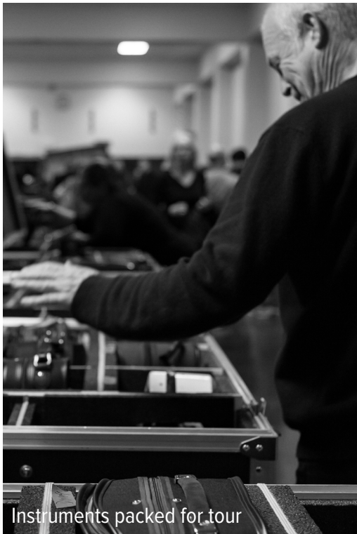
Instruments packed for tour