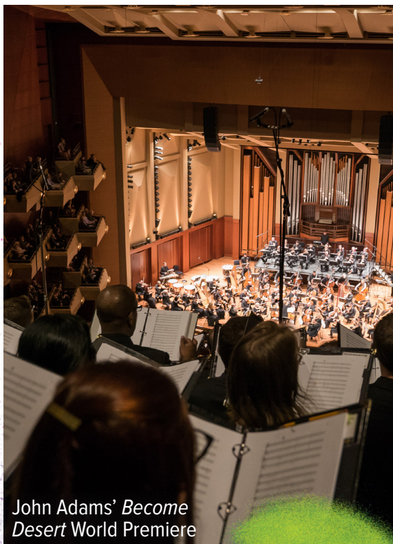
John Adams' Become Desert World Premiere